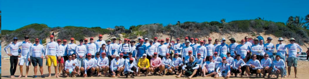
Stealth Paindane Species Competition 2010