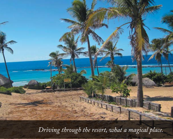
Driving through the resort, what a magical place.